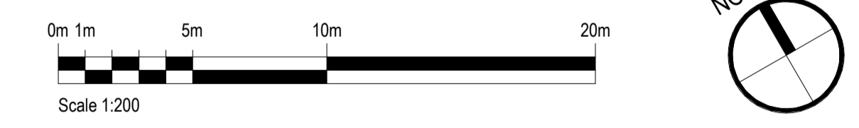
1 Level 00 Floor Plan 011010 SCALE 1:200

Note: MS2 Architectural drawings are to be read in conjunction with MS2 Architectural Report and MS2 Outline Specification as well as all other relevant discipline reports and drawings, including Atkins Structures, Civils and Landscape, CPW MEP, MLM Fire Strategy Report and AJA Acoustic Report